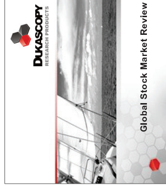
Global Stock Market Review