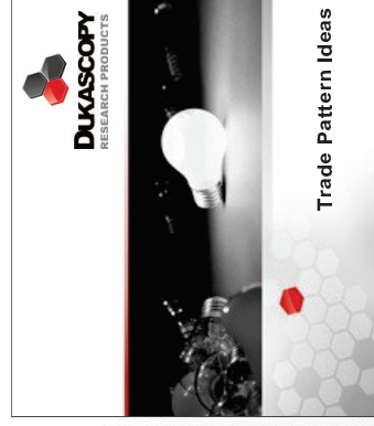
Trade Pattern Ideas