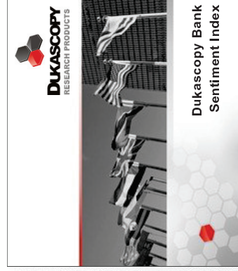
Dukascopy Bank Sentiment Index