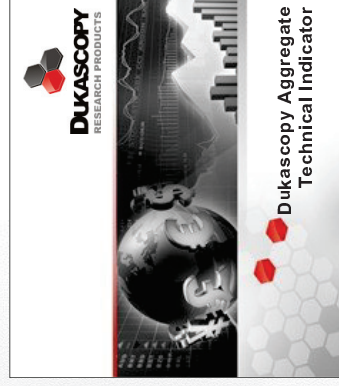
Dukascopy Aggregate Technical Indicator

Newest releases and archive: Fundamental Analysis Technical Analysis Press Review Market Research Expert Commentary Dukascopy Sentiment Index Trade Pattern Ideas Global Stock Market Review Commodity Overview Economic Research Quarterly Report Aggregate Technical Indicator